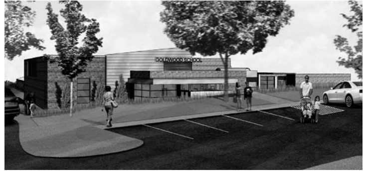
View from Center Ridge Road at West Entry Drive